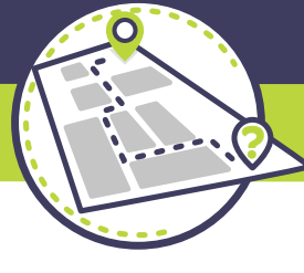
Deliver and implement