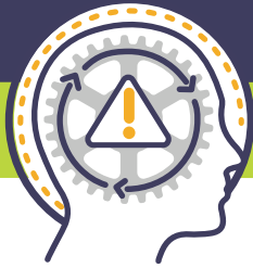
Develop a solution